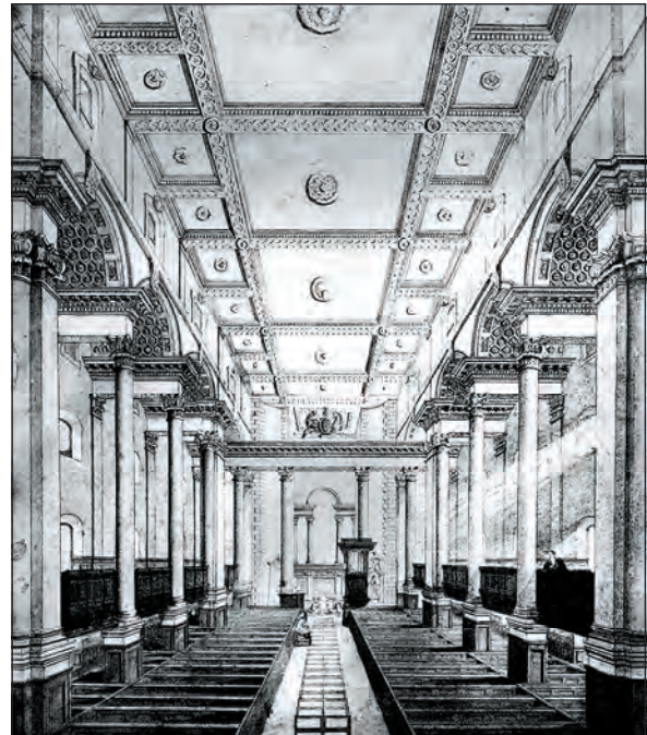
Drawing of unknown provenance showing the interior of Christ Church before the galleries were removed. The original caption reads:

Following extensive research by the architect the gallery structures will be rebuilt using materi-